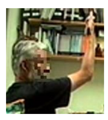
Figure 6. A: "saving souls" (Excerpt 5, line 7)

As A says "saving souls" (line 7), he raises his right forearm upwards, palm vertical, and his right index finger is extended vertically (Fig. 6). This kind of pointing gesture, thus, refers to something going up in the sky. The stroke of the pointing gesture co-occurs with