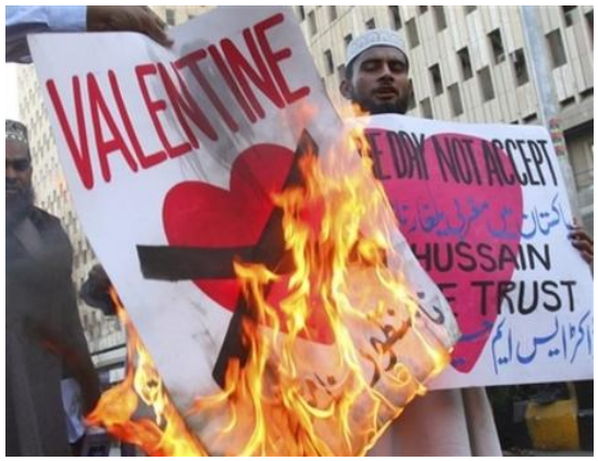
Anti-Valentine's Day