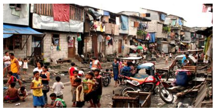
Shantytown in the Tondo District of Metro Manila