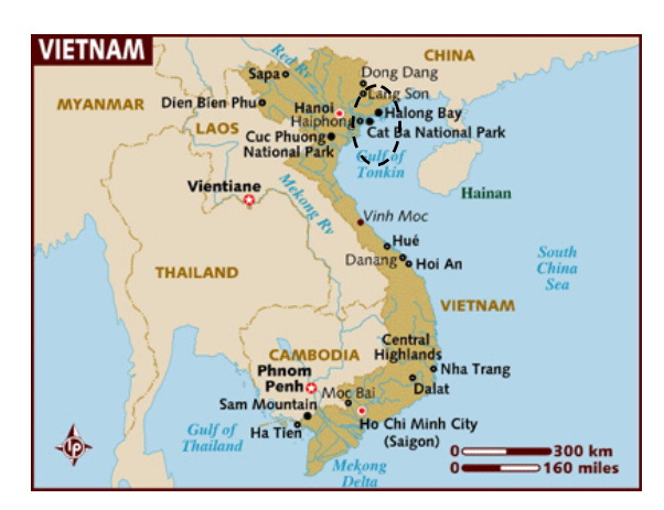
Level College level (first year English majors)