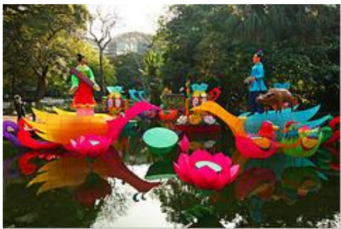
Chinese Valentine's Day: The ancient romance story of the "Meeting of the Cowherd and the Weaving Maid"