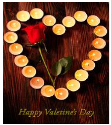
Happy Valentine's Day